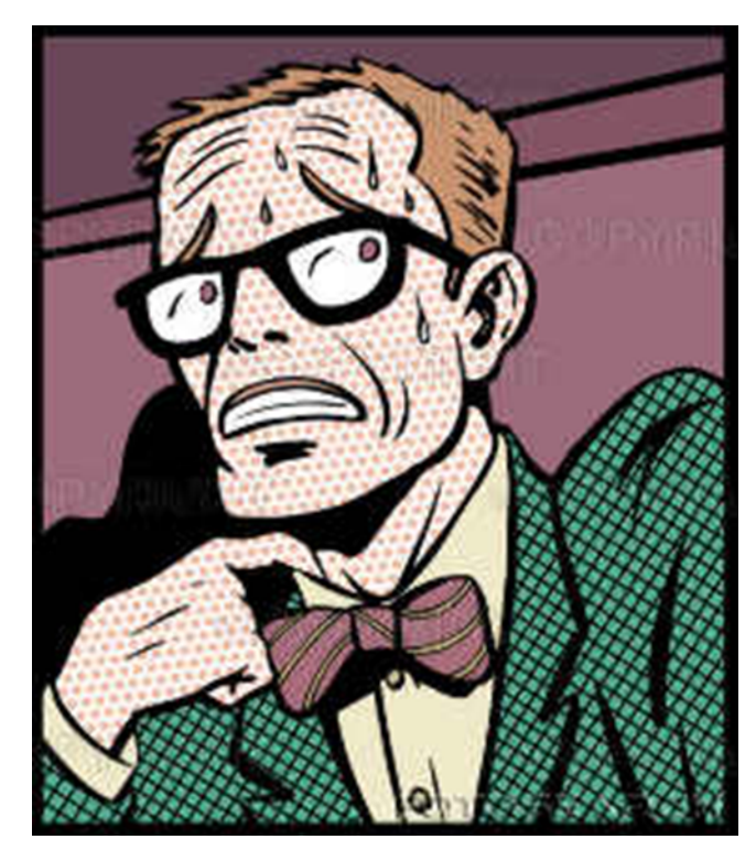
http://www.greenbuildinglawupdate.com/uploads/image/nervous%20guy%281%29.jpg, January 10, 2013